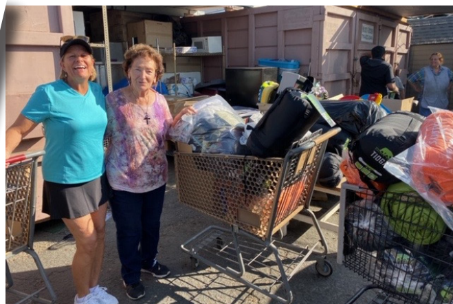
Shoes/Sleeping Bags donated to Mary's Kitchen